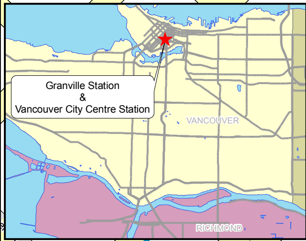
Granville Station & Vancouver City Centre Station