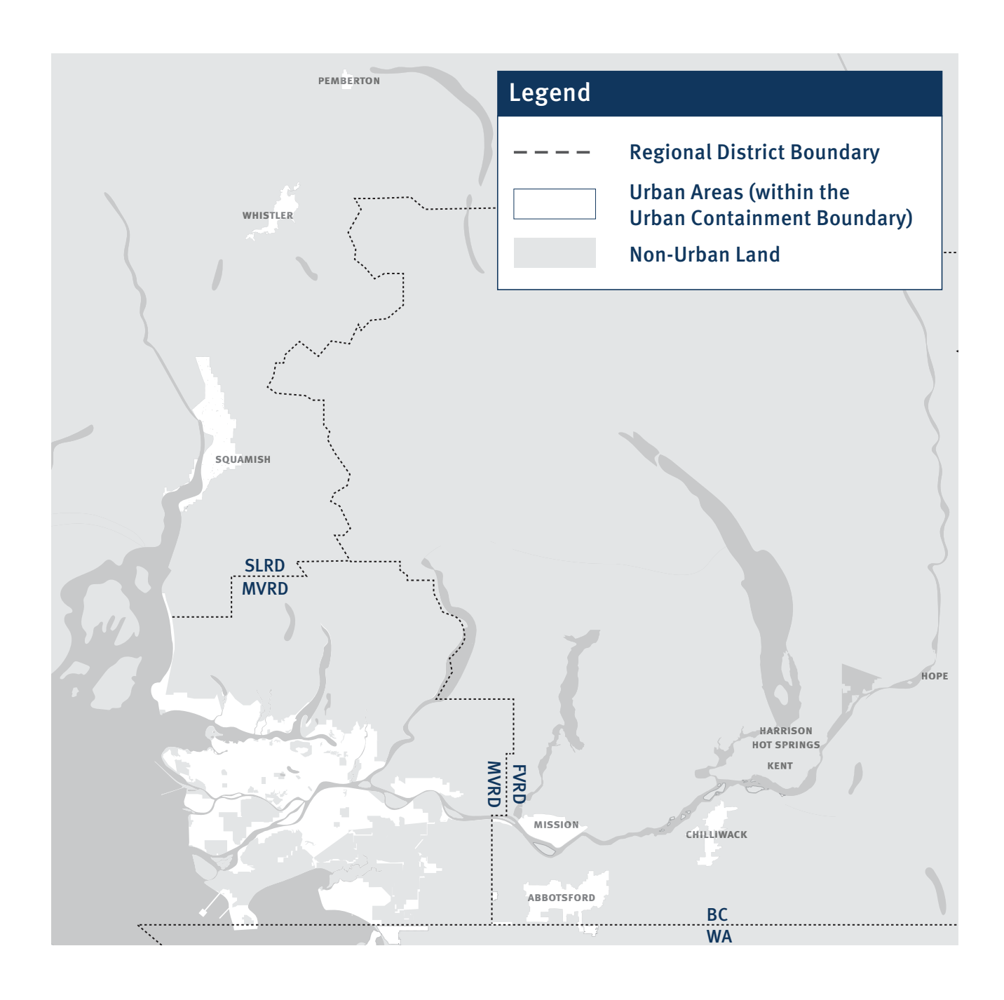
Map 1: South Coast British Columbia Region

Our region is increasingly economically and socially integrated with the entire South Coast area. Engagement and co-ordination with the Government of BC, Squamish Lillooet Regional District, Fraser Valley Regional District, and neighbouring municipalities will be essential towards achieving our shared objectives.