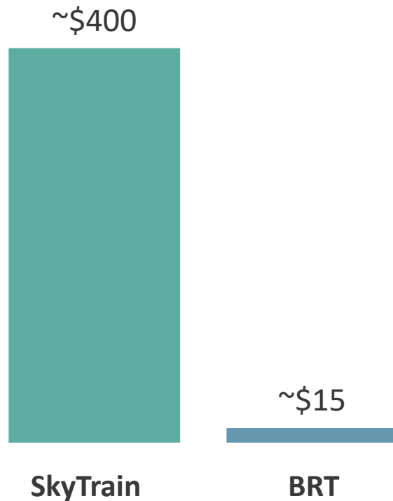
Cost per kilometre (million)