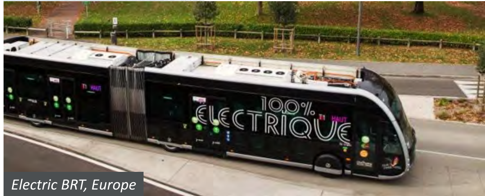
Electric BRT, Europe