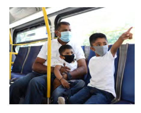
Replaced and improved

at SkyTrain stations, to provide customers with important safety and system information while they wait for their ride