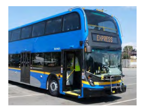
Introduced 32 additional