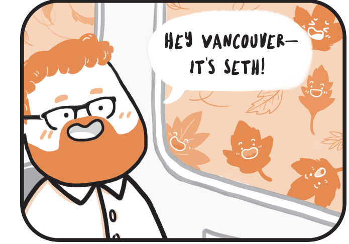
Published by TransLink • August 24, 2018