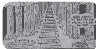
An illustration from the June, 1946 Buzzer.

"The motorman on the English Bay lines in the early days probably steered by compass, heading in the general direction of westward-ho from Granville Street.