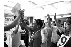
High fives all around!

Over 130 people came out on August 8 at Queen Elizabeth Theatre Salons to share the evening fun with us. This year, we asked guests to register and the event was so popular, we sold out of tickets within the first few days! Thank you all so much for your enthusiasm in joining us to celebrate why we love transit. Below are some picture highlights from the night! For more photos visit buzzer.translink.ca