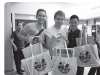
Some of our prize winners