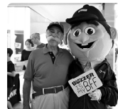
Mr. Buzzer is his BFF