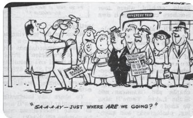
An illustration from the September 8, 1961 Buzzer.

"Even the driver on each trip is unaware of the destination when his bus leaves Vancouver Bus Depot. He and his passengers discover together where they are going as five sealed envelopes are opened by passengers at points along the way. This keeps the mystery alive throughout the trip"