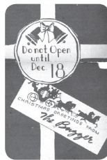
The Dec. 18, 1936 Buzzer cover.