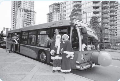
Santa, Mrs. Claus, the bus operating elf and the reindeer bus pose for a photo!

Keep your eyes peeled for the bus, and send us your pictures of it to thebuzzer@translink.ca . We'll post them on the Buzzer blog!