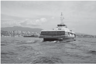
The new SeaBus will launch this December (pending approval from Transport Canada!)

Visit the Buzzer blog at buzzer.translink.ca for more transit news! In December, the blog will have the inside scoop on the new SeaBus launch, holiday service reminders, the proposed Canada Line YVR Addfare, and more.