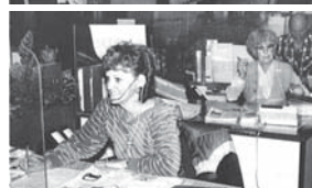
Our call centre in 1959 and 1984!