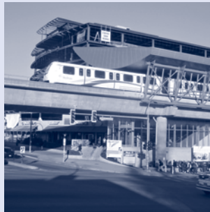
A tower goes up behind Production Way station.

Inevitably, some projects bring some short-term inconvenience, with buses diverted at New Westminster and Production Way stations, and the wheelchair-accessible pedestrian bridge at Sapperton station still unavailable for a few more months. We thank our customers for their patience.