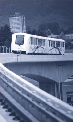
The province plans to spend $10.3 billion on Metro Vancouver rapid transit by 2020.

We're already working with the Ministry of Transportation to move the plan forward. That means better service for busy corridors, and more rapid transit and buses for underserved areas like the Northeast Sector and the South of Fraser. Sooner rather than later!