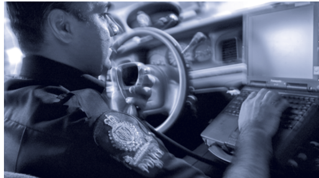
Better safety and technical equipment will help police keep transit more secure.