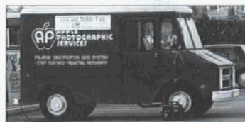
Mobile unit photo sessions

When going to The Artona Group, Mountain West Studios or the mobile unit, students must have a GoCard application form (available at school offices) signed by a school official, proof of age (birth certificate or passport) and a $5 fee. A GoCard will be issued immediately.