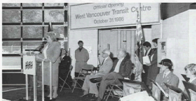
The Hon. Rita Johnston, Minister of Municipal Affairs and Transit, and West Vancouver Mayor Derrick Humphreys officially opened the new centre on Friday, October 31.