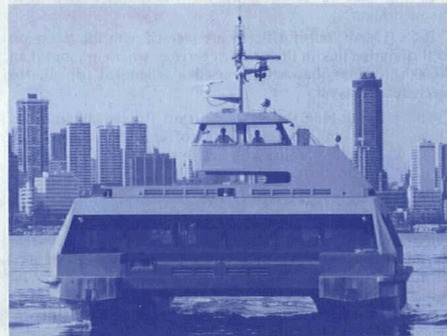
Bright orange Sea-Bus is a welcome newcomer to the Vancouver transit scene.

Friday, June 1, 1979 Vol. 64 No. 9 Published by B.C. Hydro Transportation