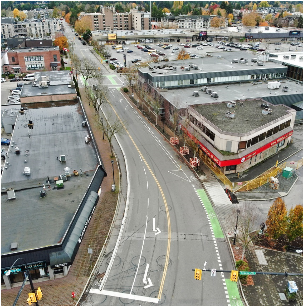
Langley City downtown cycling enhancements, featuring new protected bike lanes and improved road markings to support safer and more accessible active transportation.

Who Can Apply: Local governments and First Nations