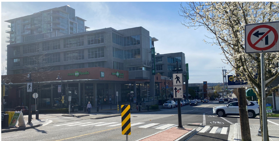
Enhanced pedestrian safety at E Columbia St and Simpson St in New Westminster, featuring upgraded crosswalks and improved accessibility.

Who Can Apply: First Nation communities and organizations