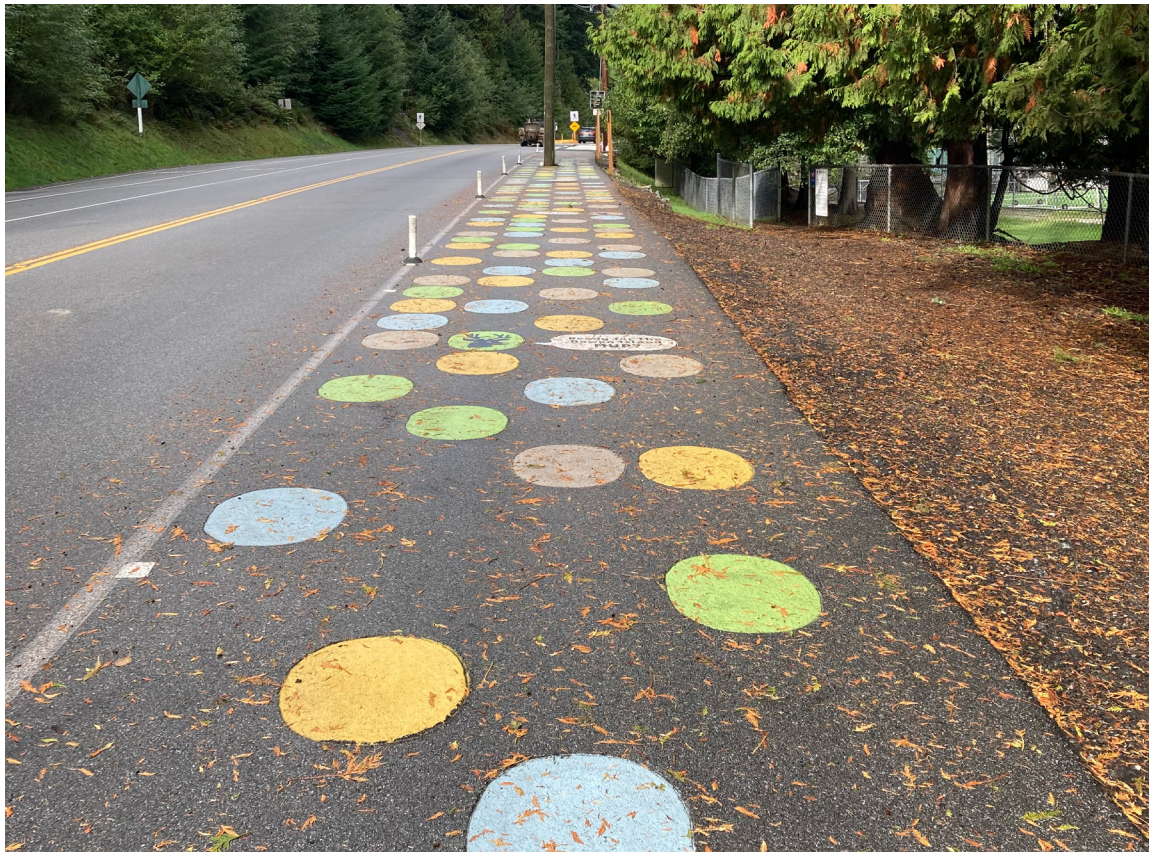
Colourful wayfinding markers along Bowen Island's cross island multi-use path.

Who Can Apply: Local governments and First Nations