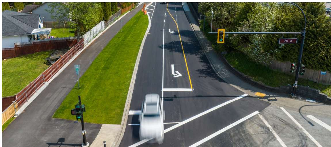
Aerial view of the multi-use path along Abernathy Way (224 St- 232 St) in Maple Ridge.

Who Can Apply: Local governments and First Nations