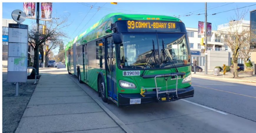
TransLink 99 B-Line articulated bus.