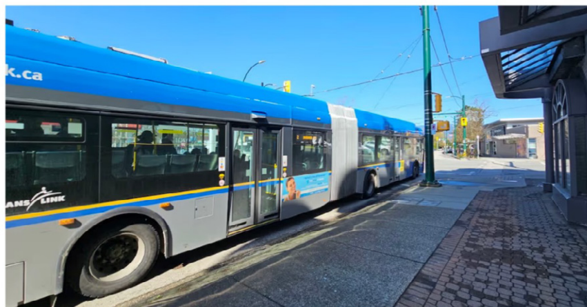
TransLink articulated bus.