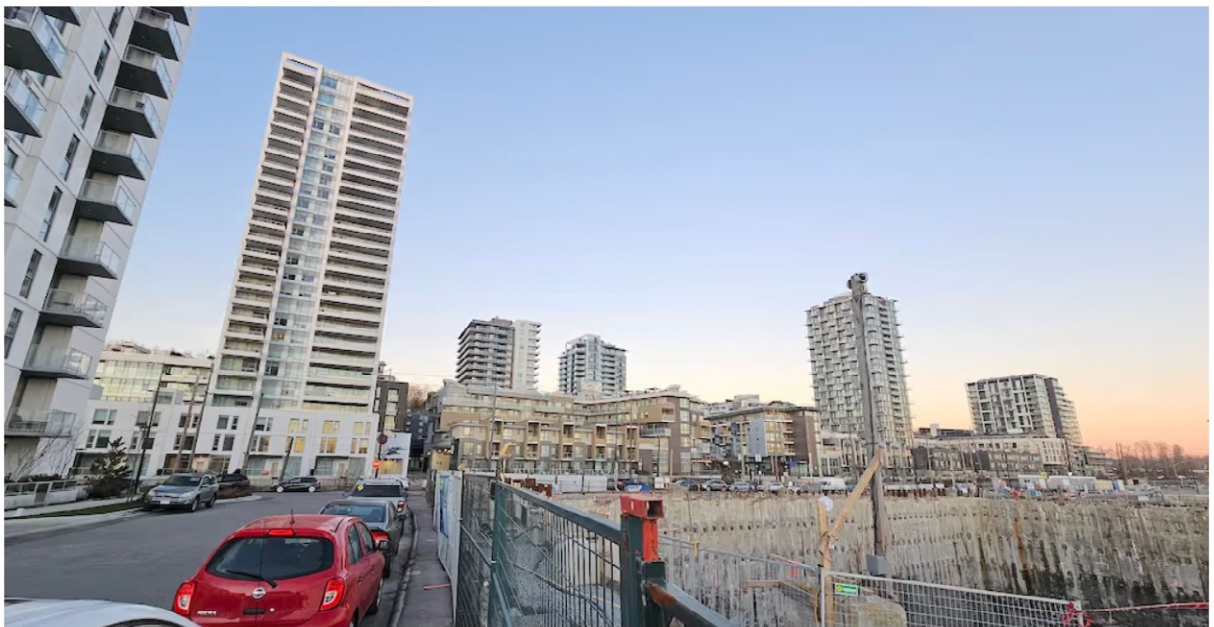
River District (East Fraser Lands) in Vancouver, January 2025.