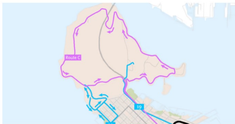
Map of the new proposed Stanley Park Drive bus route. (TransLink)