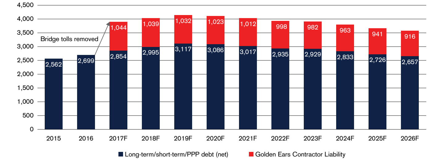
Exhibit 2: TransLink DBRS-Adjusted Debt ($ Millions)

However, the financing strategy for the replacement of the Pattullo Bridge is a source of uncertainty for TransLink's debt burden in the near term and will be monitored in the coming months for potential impact on the credit profile. Future investment plan updates encompassing the second and third phases of the Mayors' Vision may also lead to debt growth beyond that envisioned in the current investment plan, and DBRS will continue to evaluate the outlook for borrowing as new information becomes available.