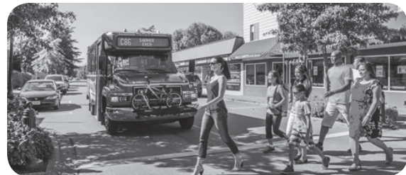
ANVIL CENTRE 777 COLUMBIA STREET, NEW WESTMINSTER Right next to New Westminster SkyTrain Station

Join us on June 26 from 10-11:30 am as we mark 125 years of public transit in our region and share the milestones of 2014. We'll review the financial and operational highlights from 2014 and recognize the people that keep us moving today and into the future.